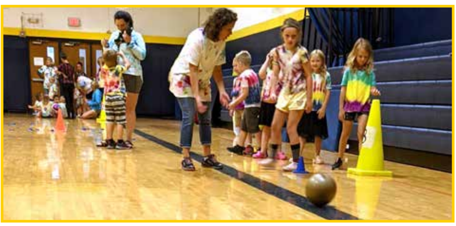
Field Day Bowling.