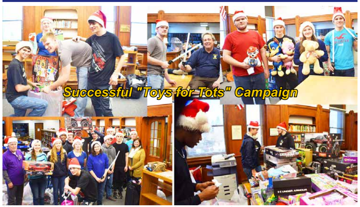
SCS high school students are shown with collected donations for the annual Toys for Tots campaign.