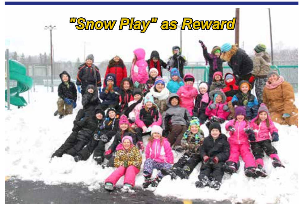
Our first and second graders have been working hard throughout quarter two. To reward their hard work, we got dressed for the cold, and we went outside to play in the snow. The weather was perfect and we had a great time playing in the snow!